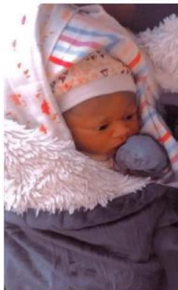
Newest arrival born 2/4/21